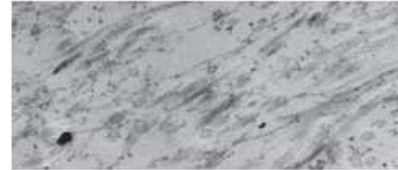
Untreated reconstituted skin (control)

Baume 27, applied on treated reconstituted skin for 24 hours, induced an increase in dermal density. Indeed, the dermis shows a richer extracellular matrix with more collagen fibres.