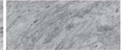
Reconstituted skin treated with Baume 27