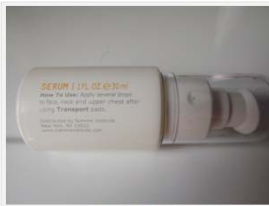
Somme Institute Serum