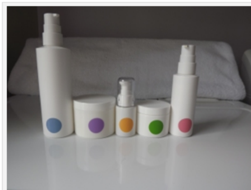
Somme Institute 5 steps

I've been very quiet on the skincare front lately but that's about to change. I've spent the last 2 months using the most wonderful skincare system and now it's time to share. As a beauty blogger I get the chance to try out a lot of products and I always want to give them a fair shake before reporting to you; a month is the typical amount of time before I report on something. I'm currently using a 5 step program from Somme Institute and it's been 2 months of pure pleasure. I knew very quickly that this was a skincare system that was working for me but a few things happened that made me realize what a fabulous brand this is.