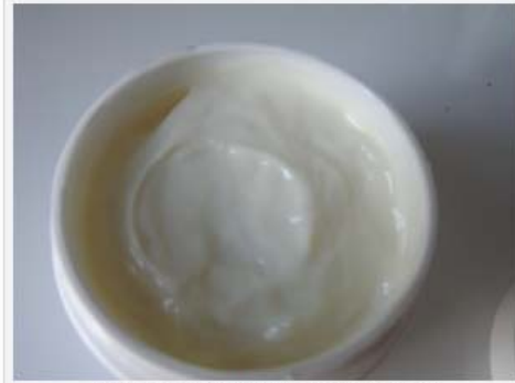
Somme Institute interior of A Bomb

Step 4 A-BOMB : As you can tell by the name this is a product containing vitamin A plus vitamin E. This is considered to be a Vitamin Infused Moisturizer and can be used independently but the real beauty is when you use this in conjunction with the Serum and program since they work together synergistically. This is a fluffy moisturizer that my skin just drinks up.