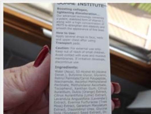
Somme Institute Serum box

Step 3 SERUM : This serum is a vitamin C serum that was created by Somme and maintains a high concentration of the C benefits without oxidizing or losing its potency. Two drops is enough for my entire face, neck and décolleté.