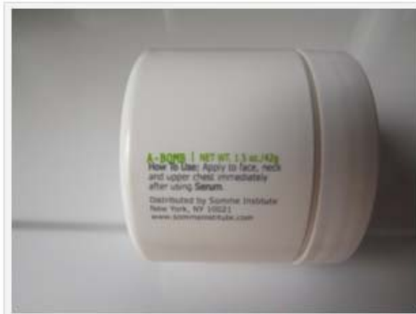
Somme Institute A-Bomb