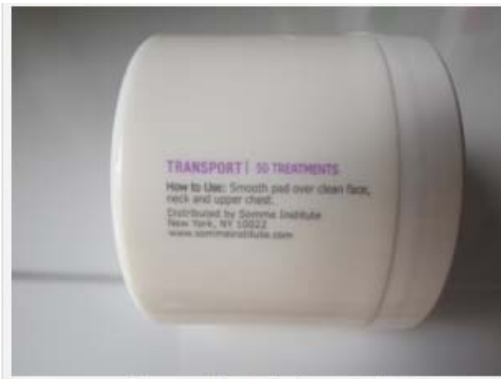
Somme Institute Transport