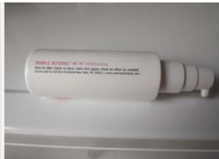
Somme Institute Double Defense

Step 4 A-BOMB : As you can tell by the name this is a product containing vitamin A plus vitamin E. This is considered to be a Vitamin Infused Moisturizer and can be used independently but the real beauty is when you use this in conjunction with the Serum and program since they work together synergistically. This is a fluffy moisturizer that my skin just drinks up.