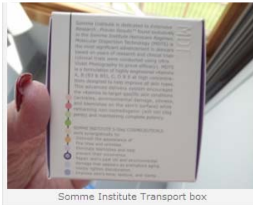
Somme Institute Transport box

Step 2 TRANSPORT : There are 50 pads in this jar that are toning and exfoliating pads. I use this just once a day although I did start out at twice a day. The pads are generously soaked with the ingredients. This removes dead skin cells while unlogging pores (aka Mt. V). It improves resiliency and gets the skin ready to receive the other treatments.